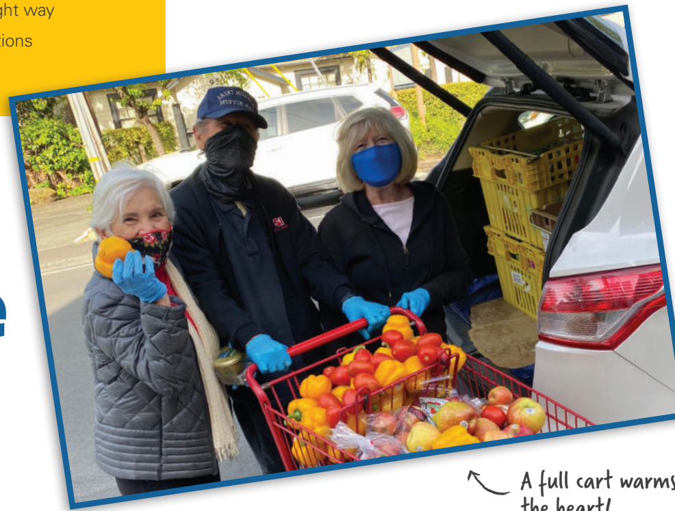
A full cart warms the heart!

If you'd like to get involved, visit StMonicaMoraga.com/muffin-people for more information. Whether or not you join in, keep an eye out for their caps, and give them a high five for their efforts!